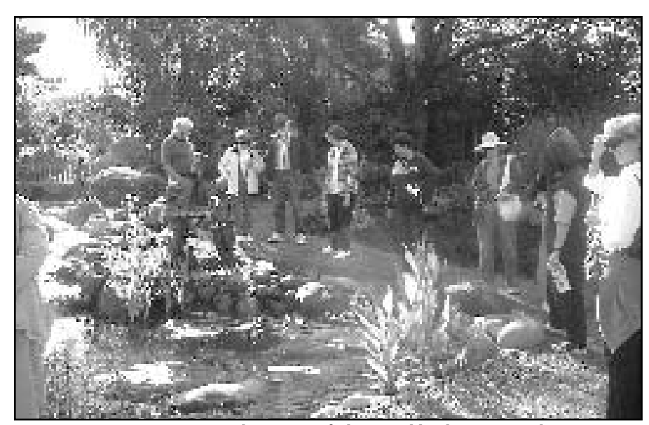
Everyone seem to enjoy the variety of plants and landscaping on the tour.

Nancy and Les Conner take a minute to rest.