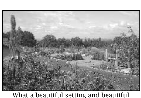
weather for a tour.